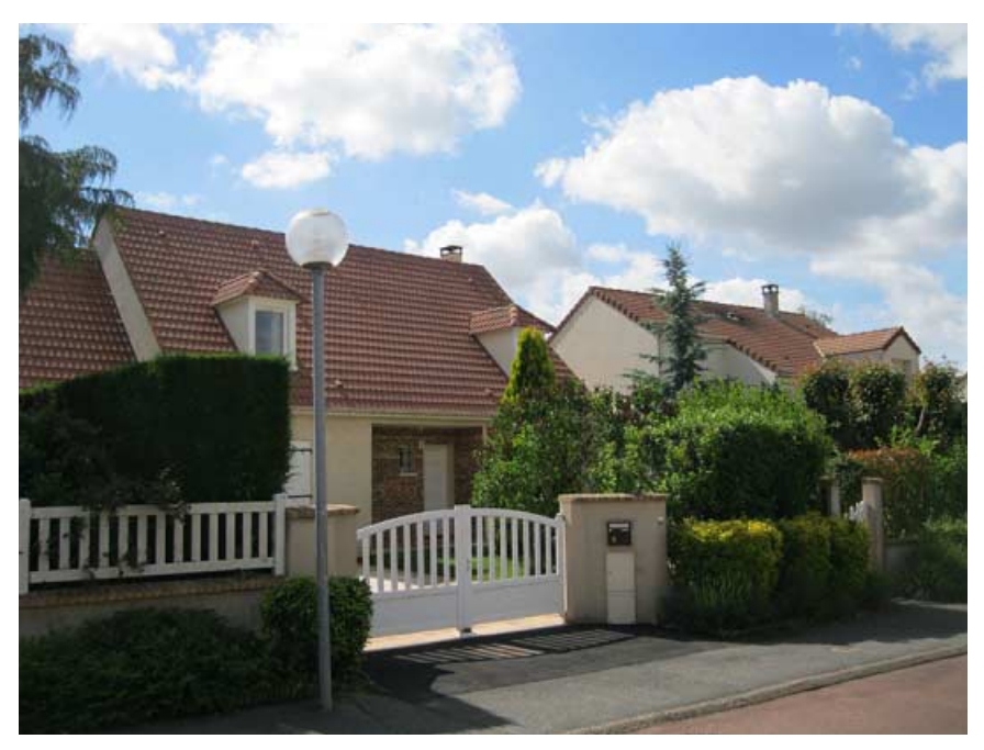
ILLUSTRATION 0.4. More recent "golf course" houses.

brutal drop in values between 1991 and 1997, then a rapid rise) have uneven consequences on different parts of the neighborhood. The houses from the 1920s to 1950s and the 1970s to 1980s thus experienced a strong upswing in value, while the row houses' value was less affected.