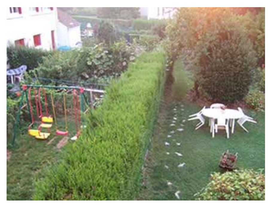
ILLUSTRATION 0.2. Adjoining yards.

peared in the neighborhood in the 1970s. The microneighborhood of row houses is populated by families with young children, fostering an intense social life, and it goes on to become the heart of the Poplars.