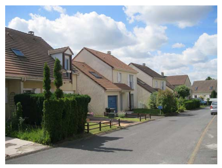
ILLUSTRATION 0.3. Mid-range single-family homes.

Because of its gradual urbanization, this assemblage of single-family homes thus brings together houses of very different sizes: the surface area can double from one to the next, and plot surface area varies to a factor of five. The row houses (by far the most numerous) are the smallest homes, with the narrowest yards. At the opposite end of the spectrum, the most recent houses are the biggest, with sprawling properties by French standards. The oldest houses and those from the 1970s to 1980s are medium-sized with rather large yards.