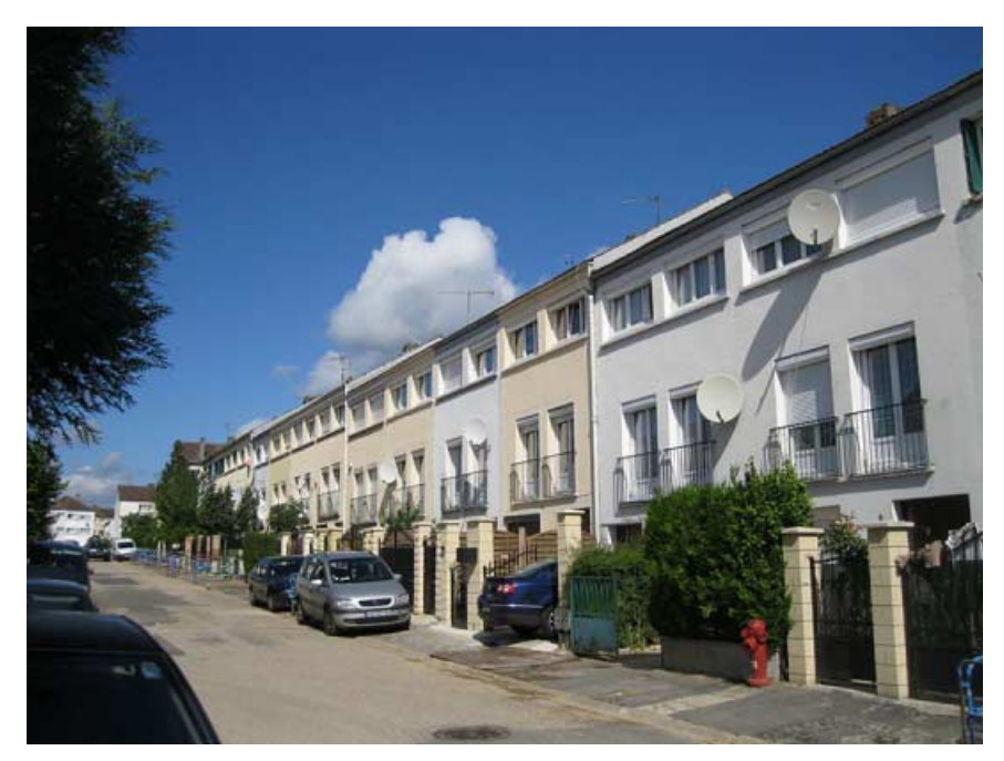
ILLUSTRATION 0.1. Row houses.

From 1958 to 1966, a large-scale development project led to the construction of 644 row houses (also known as grouped houses or townhouses)three-story attached homes with adjoining side walls (see Illustration 0.1). This project was similar to initiatives in other neighborhoods of Gonesse, greater Paris, and across France. The sales brochure of the time suggests that the appeal of these homes lay in their technical attributes that made them so modern (reinforced concrete, bathrooms with tubs and showers, water closets, central heating, ceramic tiles, parquet floors), and by a certain symbolic prestige conferred by reference to the homes as a "residence" as well as names for various house styles evoking luxurious places in and around Paris such as "Vendôme," "Monceau," and "Chantilly." The rows of houses are of variable lengths, along a street or in a horseshoe around small squares. Their footage is from 85 to 95 square meters, with four to five rooms and a garage, and they have yards of about 150 square meters (see Illustration 0.2). Homeowners' associations manage upkeep of the small squares' shared infrastructure. This makes it a rather specific kind of housing: single-family, but with points in common with collective housing. Businesses and new schools ap-