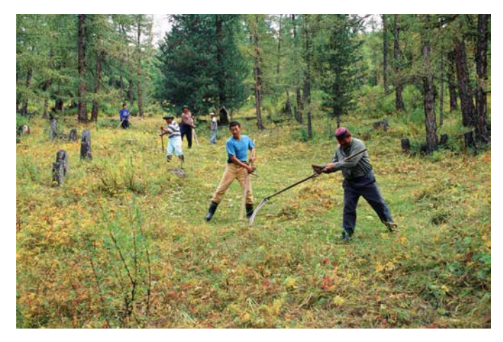
FIGURE o.i. Anton's pokos is sparsely wooded, with solitary larch trees on its lower slopes. The forest thickens as one climbs.

Kazakhstan falling in the Altai Republic, an administrative unit within the Russian Federation that borders Kazakhstan, Mongolia and China (see Figure 0.2). Witnessing that rocket fall was less of a coincidence than it might seem. Studying ethnology in Prague in the late 1990s made me susceptible to some rather outdated anthropological tenets and aspirations. With a lust for the exotic other, I inevitably ended up in one of the remote areas of Siberia -Ulagan Raion in the Altai Republic. Its infrastructure was poor, and its small population consisted predominantly of indigenous Altaians speaking what was at that time for me an incomprehensible dialect of Altaian, a Turkic language, instead of the more familiar Slavic Russian that is fairly close to my native Czech. Rocket debris likewise seemed to be attracted to Ulagan Raion, but the reasons underlying our shared attraction were nevertheless quite different. Instead of the cultural and linguistic otherness that had drawn me in, it was the low density of human population that led to Ulagan Raion being selected as the location for two rocket fallout zones back in the Soviet days.