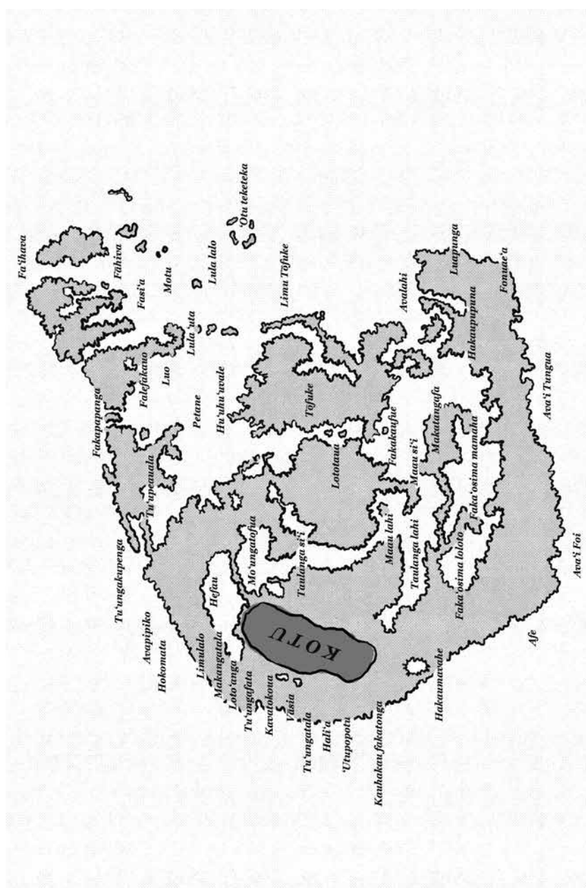
Map of Namolahi Lagoon.