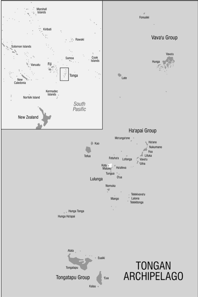
Map of the Tongan Archipelago.