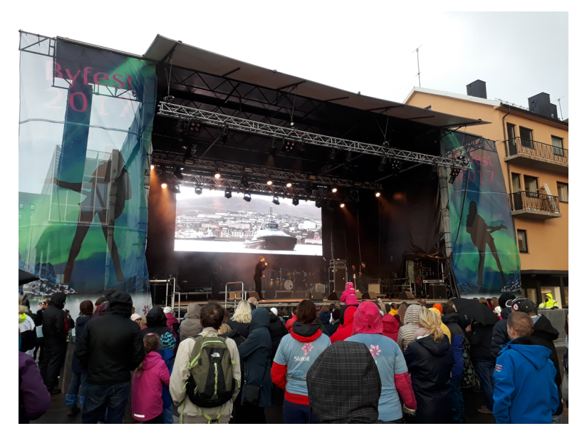
Figure 9.1. Audience members gathered for Equinor's Snøhvit anniversary in Hammerfest, August 2017. (At the time the company still operated under the former name "Statoil.")

wegian on the front. Cake was served inside a white festival tent from midday, but the crowd was relatively sparse before the program started three hours later. Throughout the afternoon, local catering businesses also sold food, much of it based on local fish and reindeer. Equinor's local industry coordinator was in the audience, beaming and greeting people in the crowd, accepting congratulatory remarks, and making small talk during the breaks between concerts.