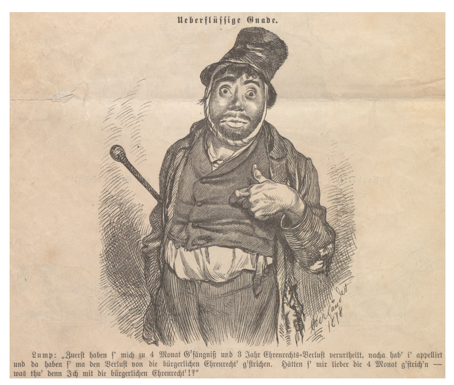
Figure 0.2. Cartoon by Adolf Oberländer. Image reads in slang: "At first they sentenced me to four months in prison and three years without my civil privileges. After I appealed, they withdrew the loss of civil privileges. I would rather have them withdraw the four months; what am I supposed to do with civil privileges?!" Adolf Oberländer, "Superfluous mercy," Fliegende Blätter 68 (1878): 192.