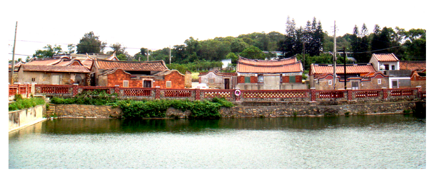
Figure 0.1. Minnan-style houses in a village in Kinmen, 2010.

tlements, or territorialized patrilineages in anthropological terms, were also found in Fujian and Guangdong (Freedman 1958, 1966) and Taiwan, which received many migrants from the foregoing two provinces (Cohen 1976; Pasternak 1972). Nowadays, the boundaries between these single-surname settlements in Kinmen are not only marked bureaucratically (the lines of settlements and administrative villages are basically congruent) but also symbolically by the preservation of ancestral halls and rituals (Chiu 2017). The persistence of these rituals suggests the continued significance of kinship in spite of the expansive marketization today promoting a shift of emphasis from a universe of wider kin ties to the self.