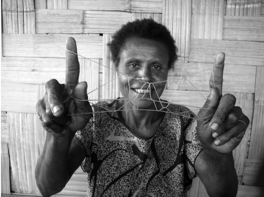
Figure 0.7: "Jealous Women." Ndaat is playing a string-figure game that tells of two women who fight with one another because they are caught up in jealousy.