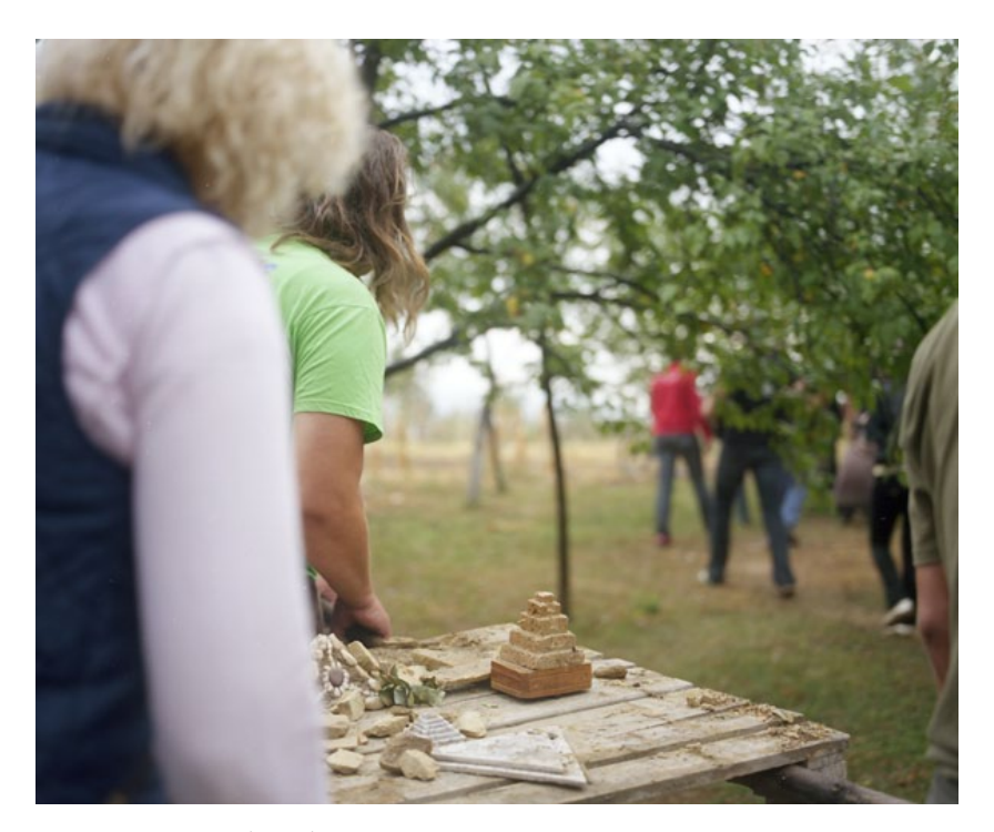
Figure 11.2 Buried Land

God-perspective of the narrator – and no license for performativity: the pre-filmic fact of an alteration should not be evident. However, the carefully constructed placement of the spear in Nanook of the North (Flaherty 1922), for example, has always been a sticking point in terms of documentary cinema's claims to veracity.5 BBC wildlife camera operators recount buying supermarket honey to goad and situate wild bears for their pre-scripted shots.<sup>6</sup> The varying practices of forty-eight documentary makers catalogued in the Centre for Social Media (CSM) study Honest Truths: Documentary Filmmakers on Ethical Challenges in Their Work show a variety of complex ethical practices relating to the representation of subjects, where filmmakers were willing to mislead people and manipulate events if this served a 'higher truth', one ultimately based on the judgment of the filmmaker (Aufderheide, Jaszi and Chandra 2009). The fact that standard documentary practices often involve coercion, staging, reenactment and biased selection, as evinced from the CSM study, makes for striking parallels between the Foundation's pyramid project and the rhetorical devices adopted by factual filmmakers.