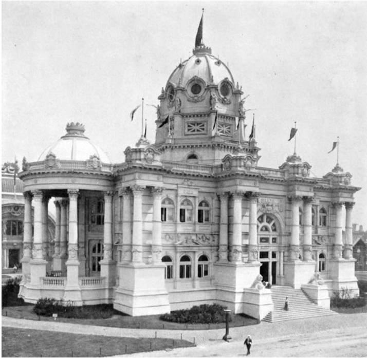
Figure 15.3 The award-winning Brazilian national pavilion designed by Colonel Francisco Souza Aguiar in the Beaux-Arts style for the Louisiana Purchase Exposition in St. Louis, 1904. Dubbed the ‘Palace of Coffee’ for its vast exhibition of coffee on the ground floor, the pavilion helped to conflate the association between Brazil and coffee in the United States of America and beyond.

workers from São Paulo prepared and served the ‘flavoursome national beverage’ in small cups, as this is how coffee is appreciated in Brazil (Relatório da Comissão 1906: 137–138). In total, more than two hundred thousand pounds of coffee by weight were served. Brazilian commissioners exulted in the success of their coffeehouse and the commercial advantage ‘of greatly popularizing the use of the Brazilian coffee under its own name instead of under the fictitious name of Java or Mocha, by which it is commonly sold’ (‘Brazil at the World’s Fairs’ 1904: 20). Asserting the provenance of the best coffee beans was matched by another central rationale for turning the national pavilion into a Palace of Coffee. In the process of nationalizing the commercialization of coffee, it also became paramount to ‘Brazilianize’ coffee drinking, as shown by the emphasis on drinking rituals and the attempt to change preparation and consumption habits in the USA.