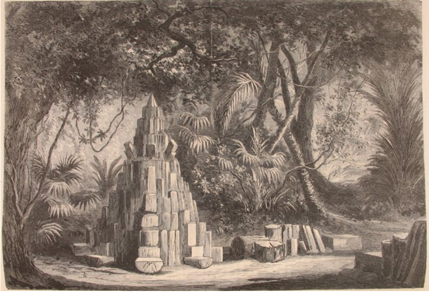
Figure 15.2 The ‘virgin forest’ was a monumental display of timber from the Amazonian Forest designed to impress the world. It showed timber previously unknown in Europe cut in horizontal, vertical and diagonal sections to demonstrate its special material properties. Around the display, a set designer of the Paris Opéra painted an interpretation of a tropical forest.

In another room also dedicated to Brazilian exhibits, a monumental display of timber from the Amazonian Forest was designed to impress the world. Arranged in a high and broad pyramid, large blocks of timber were cut in horizontal, vertical and diagonal sections to specifically demonstrate their material properties (Fig. 15.2). Around the centrepiece ran a panorama painted by Auguste Rubé, a set designer from the Paris Opéra, intended to represent a tropical forest. The dramatic scenario was set underneath a ‘dome formed by the lofty branches of a tree, behind which one could see the blue and transparent sky’ of springtime Paris (Villeneuve 1868: xlii). The Brazilian timber display was an open space. Visitors walked around the imposing collection, measuring their bodies against the gigantic Amazon trees. The spectacular tropical setting gave visitors an immediate feel of the bounty of the Amazon Forest and, therefore, of Brazil. Nicknamed ‘virgin forest’ by the French press, the display was a success, boasted Villeneuve, soon one of ‘the most visited places of the exhibition, being reproduced in illustrated magazines, and mentioned in all newspapers and journals’ (Villeneuve 1868: xlii).