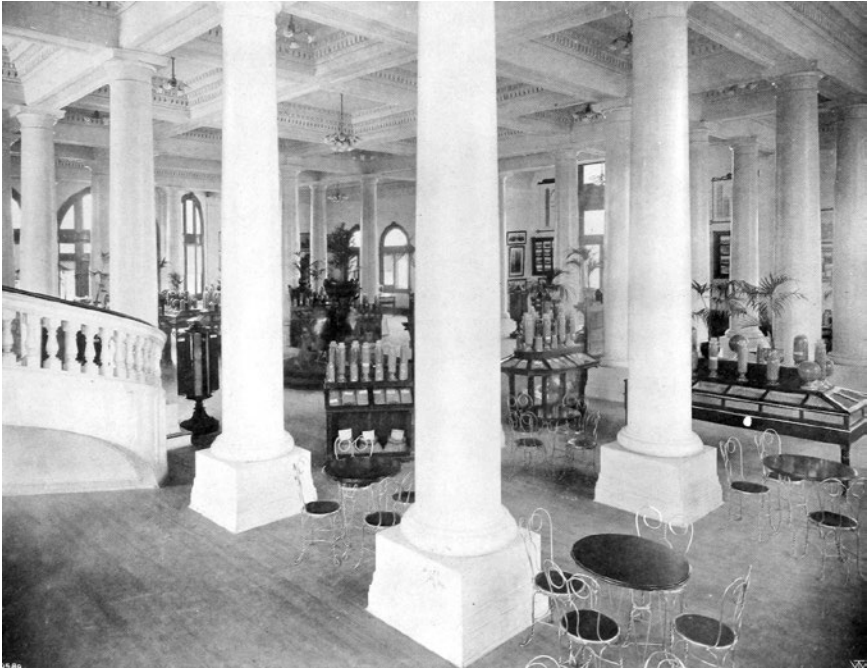
Figure 15.4 The exhibition of coffee mounted in the interior of the Brazilian national pavilion unusually emphasized the sensorial experiences of coffee consumption and production together with its visual displays. Visitors could touch the beans displayed and smell coffee being roasted, ground and prepared in the premises. Hot coffee was served free of charge everyday in dainty little cups to change consumption habits in the United States of America.

Brazilian pavilion, operating machines instructed visitors on how coffee was transformed and packaged in sacks for exportation. Visitors could touch, smell or taste the beans displayed in open sacks, judge them by colour or shininess, and choose their preferred variety from among the many cultivated in Brazil. Roasting machines processed raw coffee from green beans into hard, brown ones; grinding machines turned shells into a powder which was then brewed into the fragrant beverage served in those peculiar, small Brazilian cups. Photographs of Brazilian fazendas (coffee farms) and plantations reinforced the exhibitionary progression from beans to beverage by exposing coffee cultivation and harvest in Brazil (Relatório da Comissão 1906: 138).