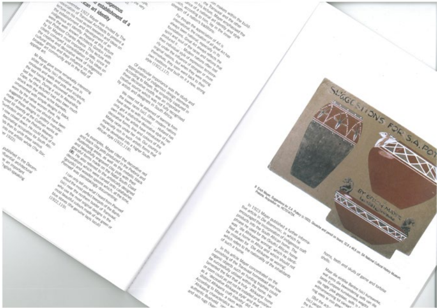
Figure 2.4 Pages 12 and 13 of De Arte 74, 2006.